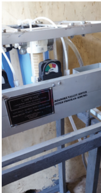
This is the water treatment system recently installed at the primary school.

Because the governor was not available to join us, we made a trip to his office and met with his chief of staff to talk about the project and outline plans for similar installations. It gave me