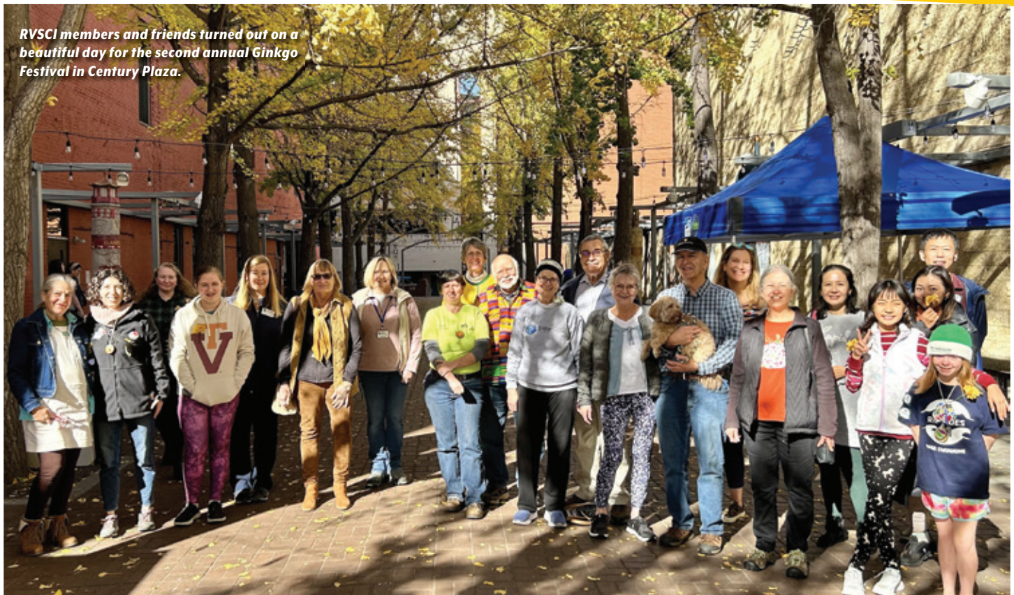
RVSC members and friends turned out on a beautiful day for the second annual Ginkgo Festival in Century Plaza.

In early October, RVSCI received the official trophy for winning the Sister Cities International 2023 award for Innovation in Arts and Culture. It is now on view in the Roanoke display case in the Municipal Building. Also in October, 30 St-Lô students and three teachers visited Roanoke, attending high school classes and touring the region. Students were housed with Roanoke Valley families, and a large potluck dinner was held at the end of the visit.