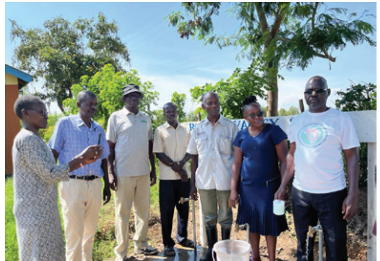
The local water committee is shown at the dedication ceremony for the water treatment system at Magunga Primary School.

Overall, I consider the trip a great success and look forward to continuing our engagement with the City and County of Kisumu in the coming years.