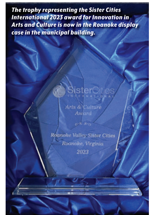
The trophy representing the Sister Cities International 2023 award for Innovation in Arts and Culture is now in the Roanoke display case in the municipal building.

representing courage, creativity, and innovation. 2024 promises to be a year full of possibilities and opportunities!