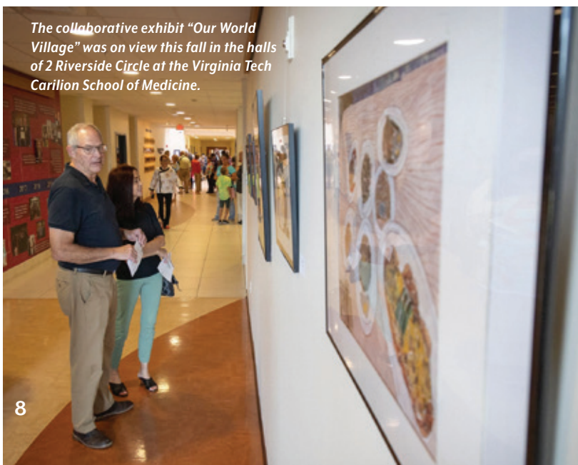
The collaborative exhibit “Our World Village” was on view this fall in the halls of 2 Riverside Circle at the Virginia Tech Carilion School of Medicine.

global health rotation in one of Roanoke’s seven sister cities. This art show is another outstanding partnership that we hope will resonate in our community.”